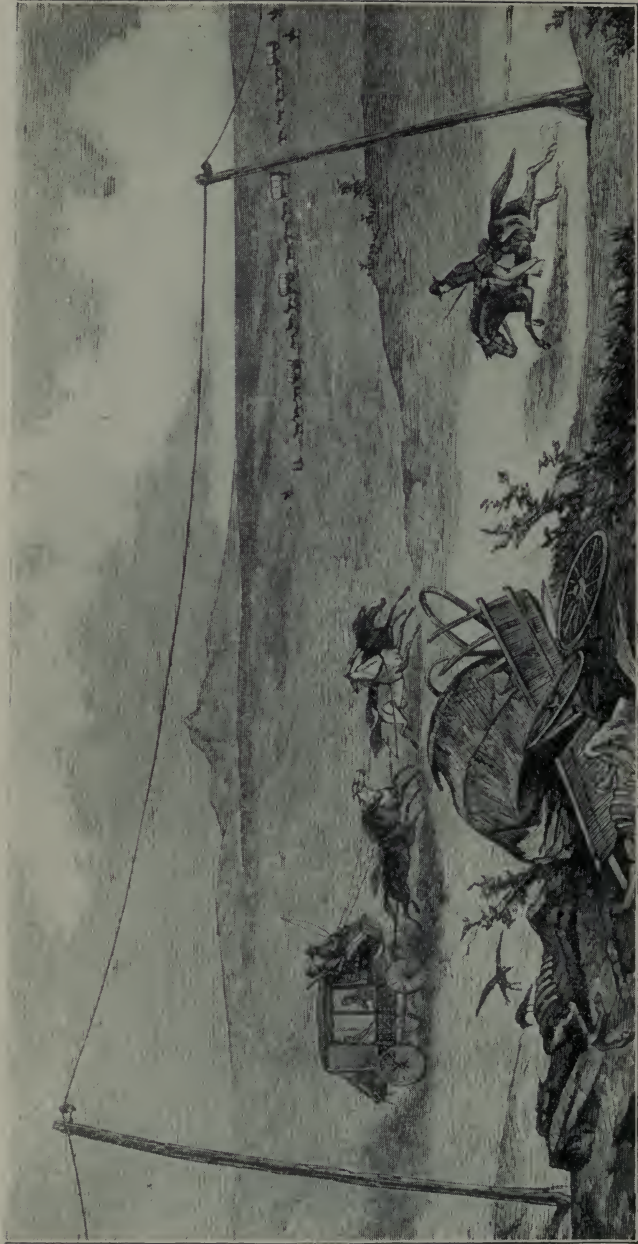
TRANSPORTATION AND COMMUNICATION ACROSS THE PLAINS THE TELEGRAPH, THE OVERLAND STAGE, THE EMIGRANT TRAIN, AND THE PONY EXPRESS RIDER